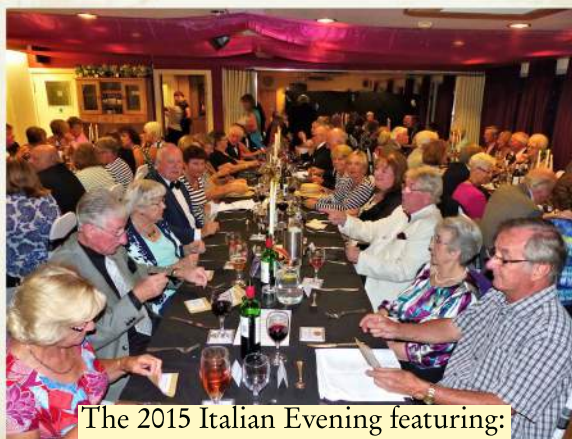
The 2015 Italian Evening featuring: The Opera Dudes