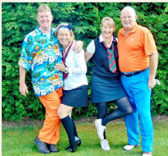
2015 Ladies v Gents - Snazzy golfing outfits!