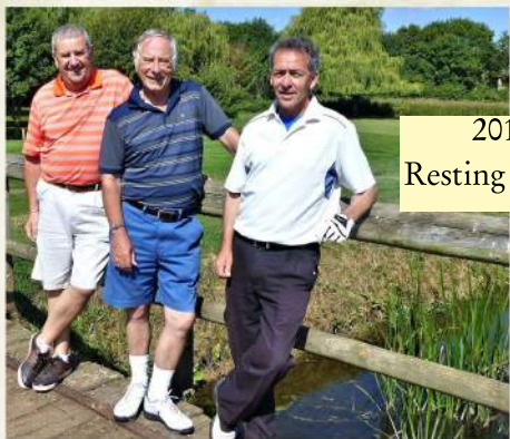
2015 Captain's Day: Resting before tackling the 9th