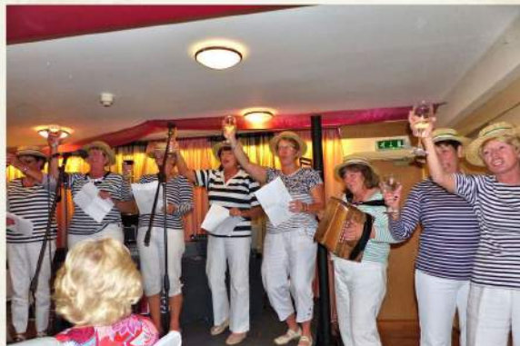
The Guernsey Ladies serenading Ramsey Golf Club members during the Italian Evening